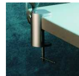
Desk clamp (accessory)