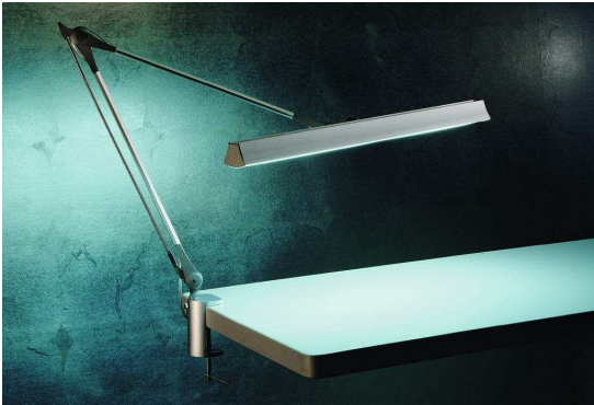
Task Light Orion Model # 026T5A